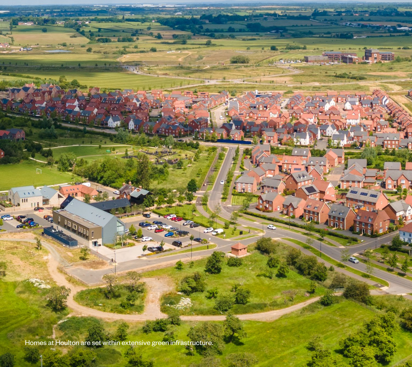
Homes at Houlton are set within extensive green infrastructure.

Houlton demonstrates the benefits of a considered, long-term strategy for the integration, protection and enhancement of biodiversity. Early investment in the establishment of a rich network of varied habitats is now delivering, year on year, a measurable increase in biodiversity.