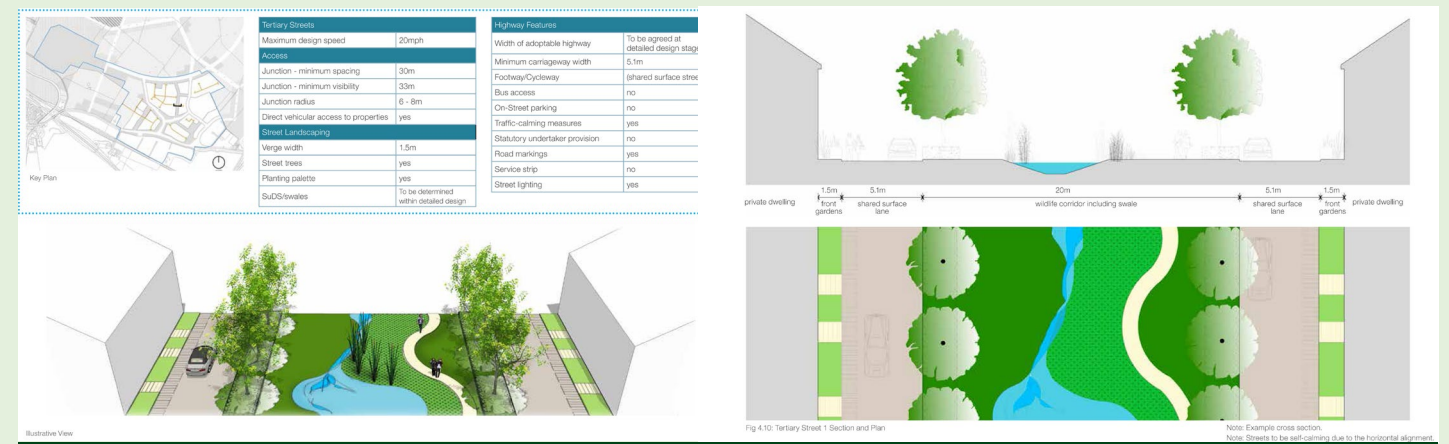
Wildlife Corridor with Street

The mitigation strategy for the Houlton GCN population has been underpinned by protected species licence applications, each of which set out detailed prescriptions to safeguard and enhance GCN populations within that phase. These individual licence strategies are in turn governed by a GCN Masterplan, approved by Natural England, that ensures a holistic approach to mitigation across the development.