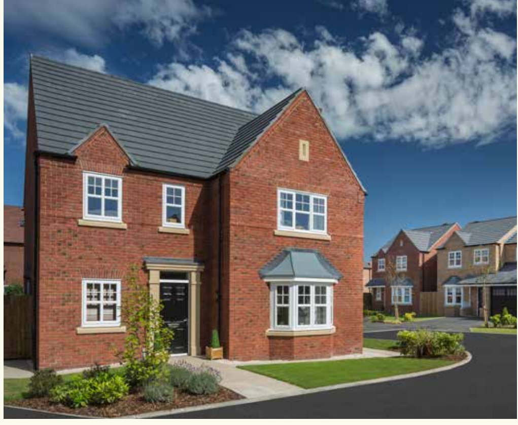
The Dunham 2

Home-hunters can now get a Morris Homes' collection of high specification 2, 3, 4 and 5 bedroom real taste of things to come homes – in addition to a handful at Morris Homes' Houlton of stunning 1 and 2 bedroom development, The Beacons. apartments - has been designed to blend seamlessly into the idyllic setting at Houlton and now, for the first time, you can get a detailed insight into what the new homes will offer.