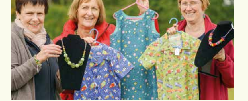
The Handcrafted Delights team

The front door is now wide open to visitors – from 10.30am-5.30pm, 7-days a week – so be sure to call in soon.