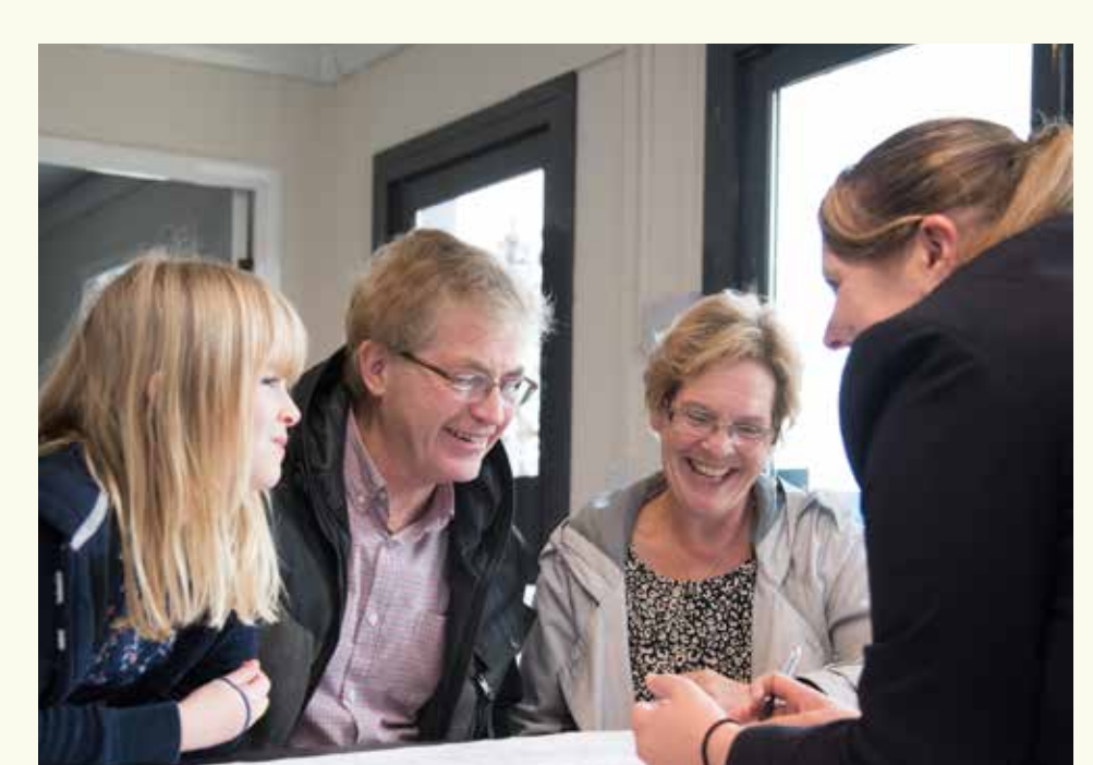
Receive a warm welcome at the Morris Homes sales cabin

With a reputation as a responsible and professional development partner in the regeneration of