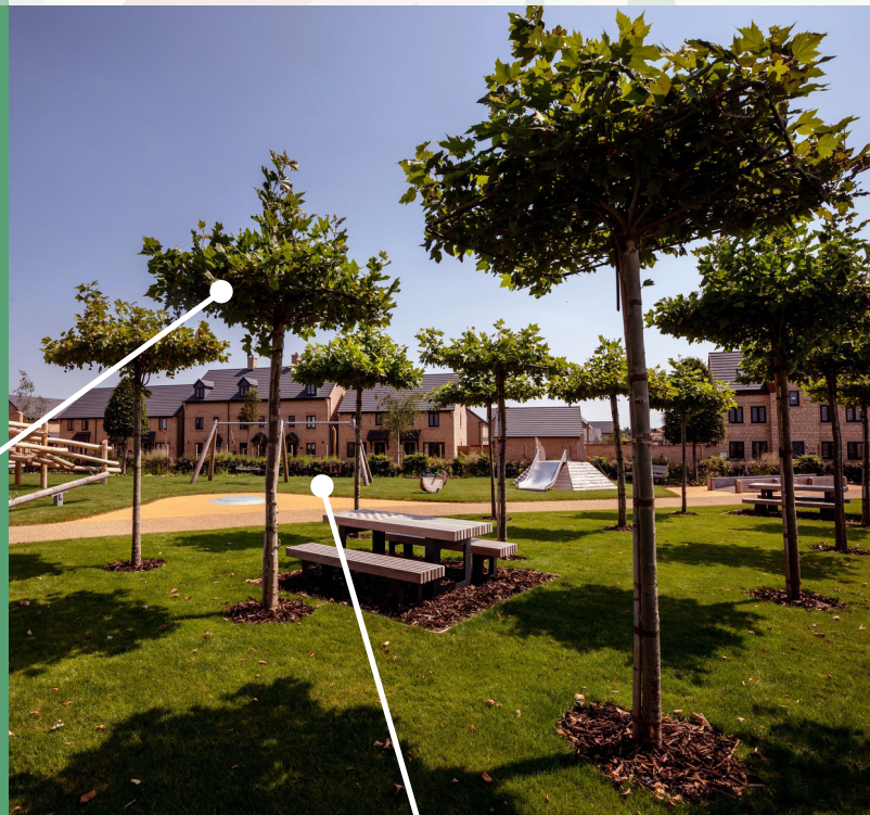
TABLE TOP TREES AND “BEEHIVE” CANOPIES PROVIDE TACTICAL SHADE POINTS TO PROVIDE PROTECTION FROM THE SUN

NATURAL GRASS SURFACING TO THE PRIMARY PLAY SPACE HAVE BEEN SUPPLEMENTED WITH A RECYCLED RUBBER GRASS MATT TO PROVIDE CRITICAL FALL FROM HEIGHT PROTECTION