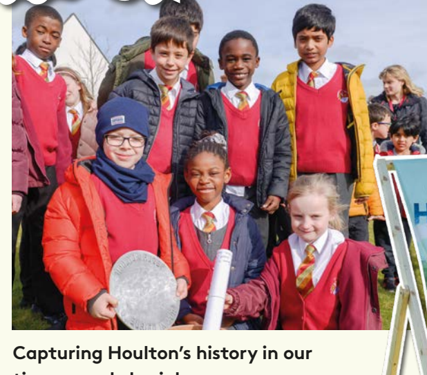
time capsule burial