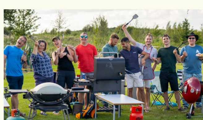
Sizzling summer fun for our residents at Houlton play park